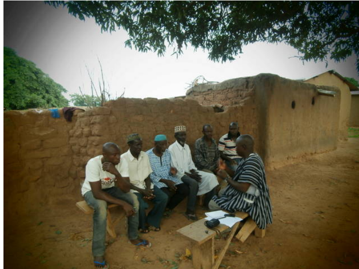
Figure 4.2 Men in Chansa in focus group discussion