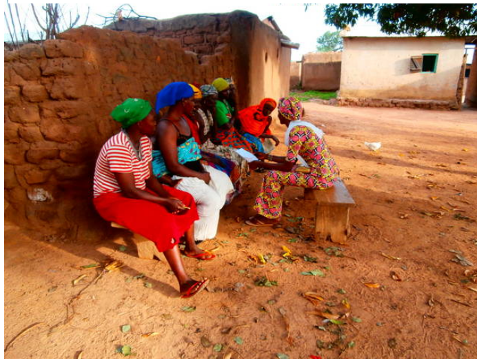
Figure 4.1 Women in Chansa in focus group discussion on sexual violence

Source: Chansa village in Wa Municipality.