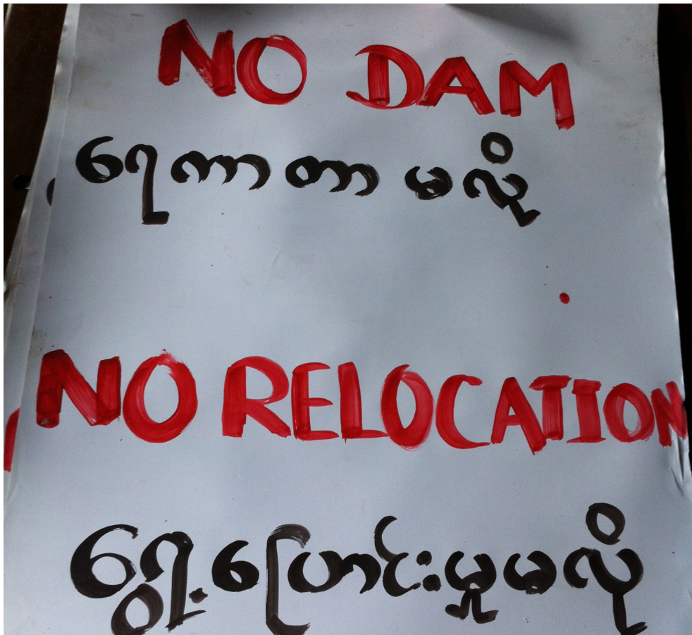
Figure 1 Signs of Resistance: Fighting ITD’s Dawei SEZ Dam Reservation

Despite strong local resistance, Dawei activists like the DDC, are failing in their efforts to stop the Thai developer, as the project pushes forward. This is likely because efforts are not addressing the fundamental reasons behind the SEZ project. In order to understand how to effectively challenge projects like the Dawei SEZ, which compromise local livelihoods and the surrounding rich ecology (instead of promoting a development model that benefits an already powerful capitalist class), it is critical to understand the underlying processes and actors enabling them.