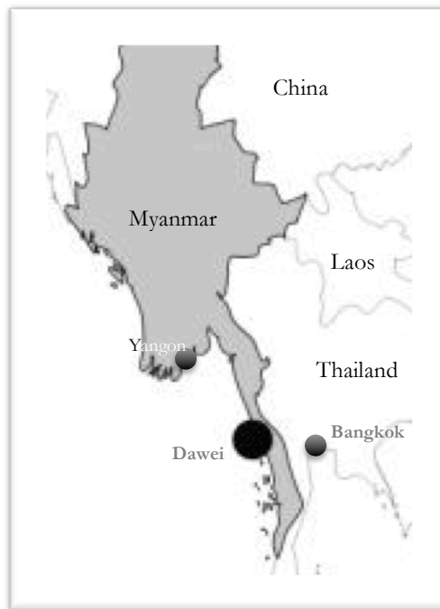
Map 2 Location of Dawei, Myanmar

The area and its peoples also have a complex history (far from notions of a peaceful, rural existence), with outside violent intervention lingering in the region for decades. In 1997, one year after an initial Thai-Myanmar road link survey was completed, the Myanmar military government launched an offensive against the Karen National Union (KNU) resistance group, leading to an estimated 20,000 people who were either internally displaced (hiding in jungles, etc), forced into military-established resettlement camps, or those who fled to Thailand (Abreau 2012, Anonymous [A3], 15.08.12). Now, the residents who are left face a wave of extra-economic force that will likely drive many of them out in order to make way for the industrial, trade, and logistical hub (Thabchumpon et al. 2012).