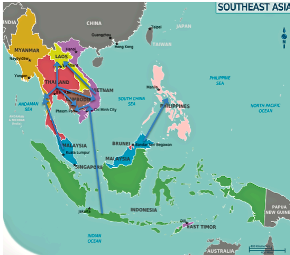
Map 1 Southeast Asia and Evidence of the Growing Intra-Regional Land Grab

Notes: Arrows represent outward land grab cases. Actual sites of land grabs are not represented here.