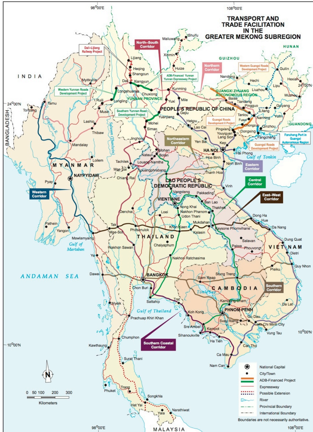
Figure 4 Transport and Trade in The Greater Mekong Sub-Region