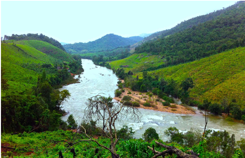
Figure 3 Thanintharyi Region: Future Dam Reservation Site