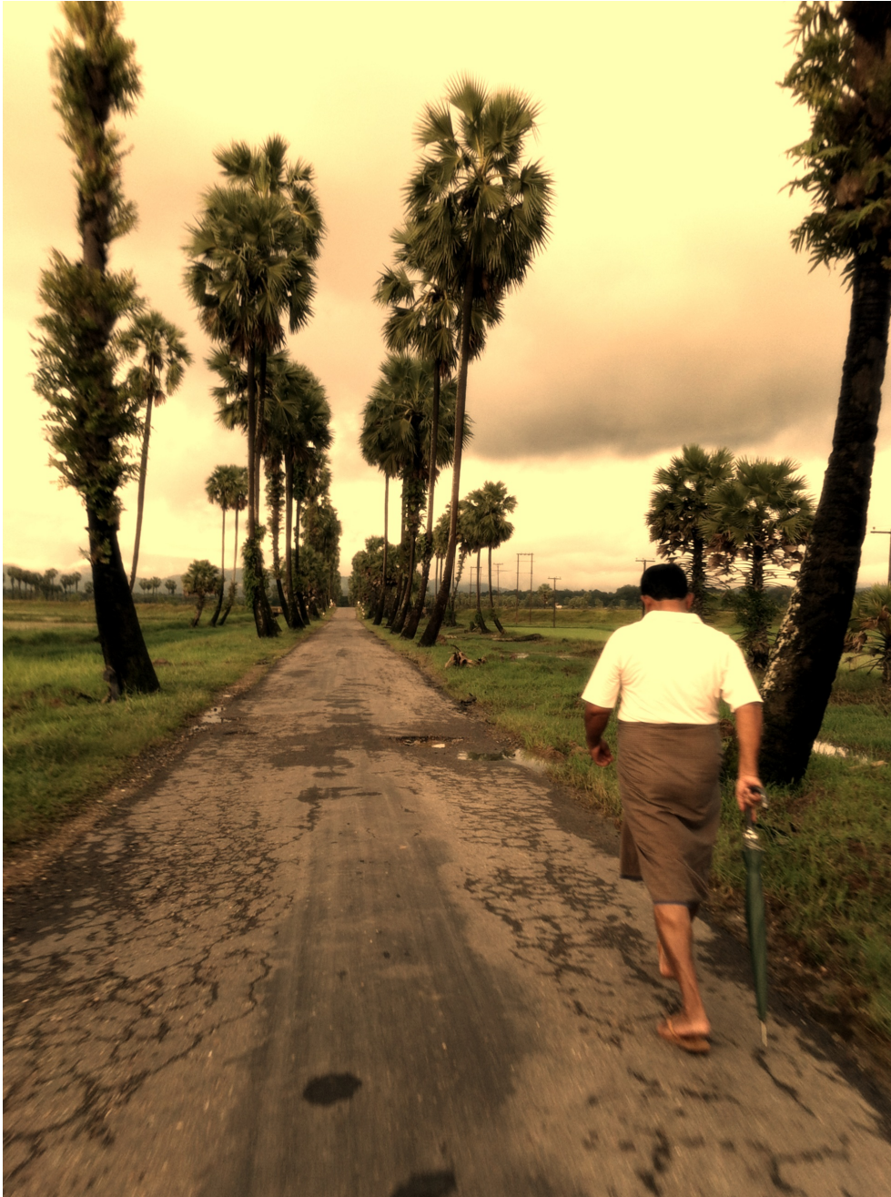
Figure 6 The Uncertain Path Lies Ahead