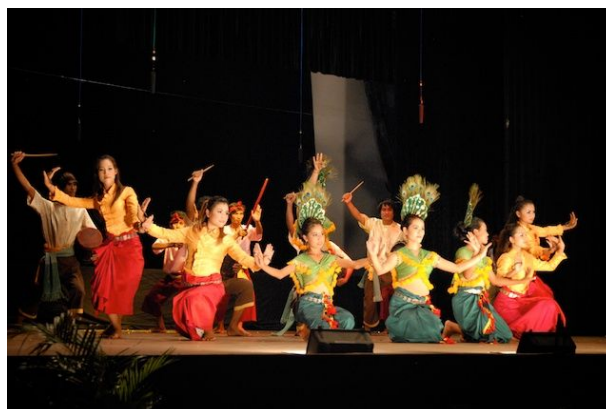
Youths performing the Folk dance.

Although these two art forms attract foreign tourists from all over the world, there are other diverse expressions. Folklore dance (Robam Prapeini) refers to traditional dances linked to an ethnic group's ceremonies, and their motifs are usually based on the everyday life of the people in the village (Ministry of Culture and Fine Arts and UNESCO 2004: 33).