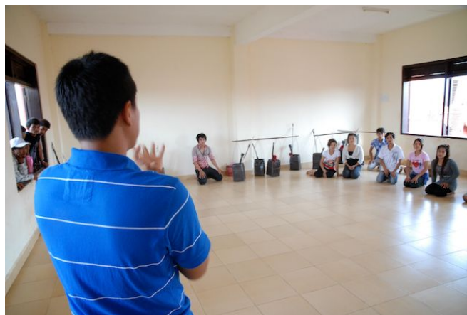
A teacher instructing students in the Folk dance.

“Nowadays, we cannot punish students. We have to persuade them rather than punish them. When I was a student, we used to be forced to run round a schoolyard, for instance 20 times, or sometimes, to stand on one leg. The teachers were very strict. However, after those periods, I realized that all punishment benefits the students, as practice in dance. ...Nowadays, especially students over 14, 15, 16, they have their own opinions, and they don’t listen to the teachers.” (Male teacher, who has taught for almost 10 years in ‘Folklore dance’)