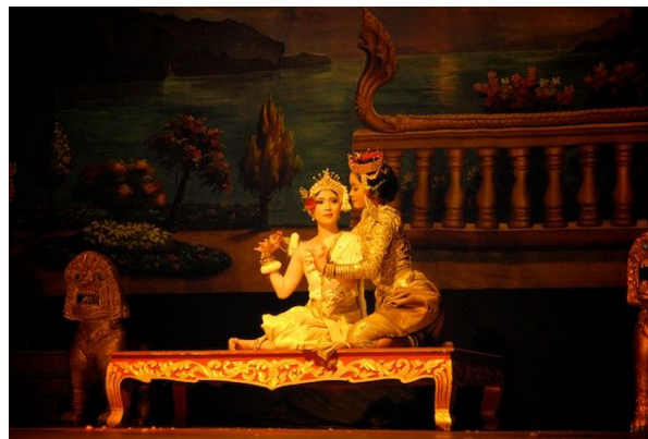
Youths performing the Classical dance. Photo by the author 2012.

The Khmer traditional arts include various forms. Cambodian classical dance, as typified in Apsara dance, is a form performed entirely by female dancers (Burridge and Frumberg 2010: 212). Classical dance (Robam Boran) and Cambodian large shadow puppetry (Sbeik Thom) were listed as Intangible Cultural Heritage by UNESCO (Frumberg 2010: 146).