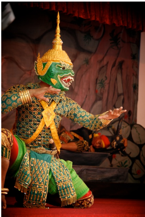
Youths performing the Mask dance.

Traditional arts, Cambodia, the Khmer culture, youth, cultural reconstruction, national identity, agency and structure.