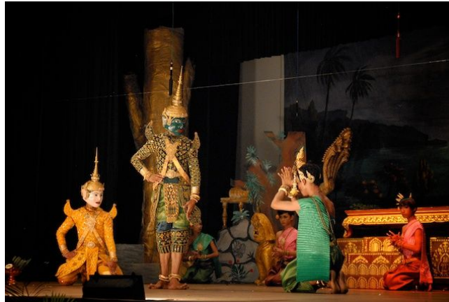
Youths performing the Mask dance.

Mask dance (Lakhaon Khaol) is one of the oldest forms of dramatic performance, which was developed as a male version of classical court dance (Ministry of Culture and Fine Arts and UNESCO 2004: 57-8). Besides, Khmer Traditional Circuses, which feature juggling and acrobats, and Spoken Theater are also included in the Khmer traditional arts (Ministry of Culture and Fine Arts and UNESCO 2004). In addition, musical instruments ensemble, traditional crafts and artisan skills play an important role to support the Khmer performing arts. In particular, this study focused on students and artists who major mainly in ‘Classical dance’, ‘Mask dance’, and ‘Folklore dance’.