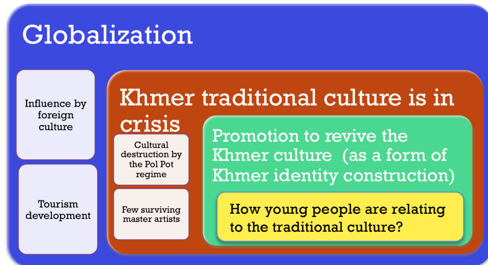
<Figure 2> Youth in Structure

understand how young people are relating to traditional culture in these circumstances.