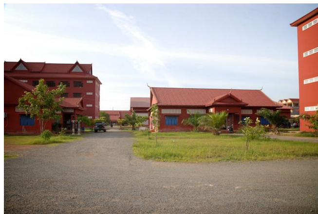
School buildings of SSFA away from a city center. Photo by the author 2012.

“After the change of location of the school, it became very difficult for students and teachers to go to school. In addition, the schedule for examination for the Secondary School of Fine Arts (SSFA) and the Royal University of Fine Arts (RUFA) used to be different, but now it is on the same day, which means that we don’t have enough time for rehearsal. One day for teachers, one day for examination.” (Male artist aged 24, who majored in ‘Mask dance’)