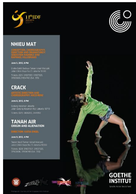
Flyer for a new work of contemporary dance 'CRACK'.