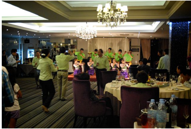
Youths performing the Folk dance at hotel.

As stated in interviews, the answer showed the difficulty to continue studying the traditional arts, and the reality in this field.