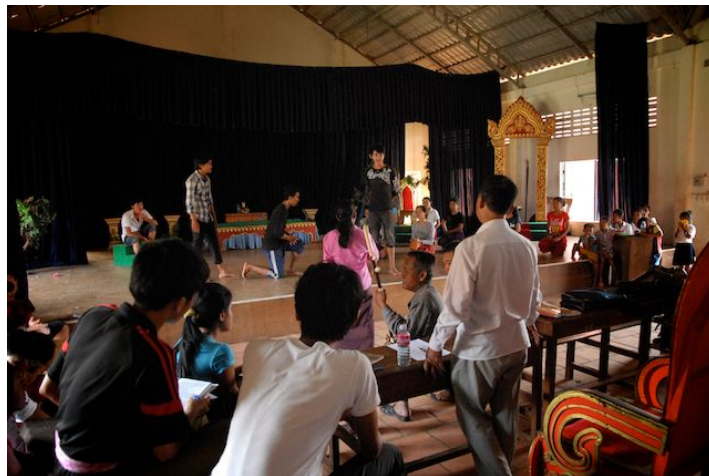
Rehearsal for performance of the Yike theater. Photo by the author 2012.

“In fact, at present, there are only a few books about the classical dancing.” (Female artist aged 26, who majored in ‘Classical dance’)