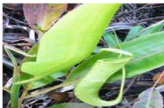
Figure 9: Protected plant (Nepenthes sp.) at Sei Rumbiya estate

The SPO Management also monitors the river water quality periodically based on National Regulation No. 82/2001 for river water, to ensure that its operation is not affecting the river.