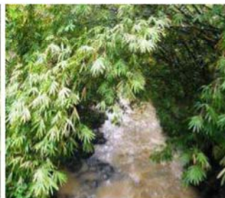
Figure 8: Riparian strip at Bungara Estate