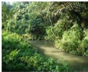
Figure 7: Riparian strip at Begerpang Estate

Training for awareness and understanding of HCV areas was conducted internally in 2006. The same year, CSIRO was co-opted to develop a model for managing the riparian strips. In 2008, WWF Indonesia was invited to train the estate managers on identification of Flora and Fauna. The maps of HCV were formally issued by BLRS (Bah Lias Research Station) in 2008, complete with the types of HCVs and GPS points. Despite Lonsum cultivating its plantations for >100 years, the fact that some HCV areas are still found is testimony to the management's concern for the environment.